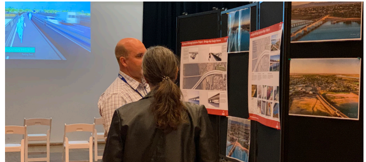
Community Information Session July 2020

The community hub is now open at 45 Commercial Road, Port Augusta . The hub is staffed by PW2PA Alliance team members and provides a focal point for members of the Port Augusta community to find out more information about the Joy Baluch AM Bridge Duplication Project, to view plans and artist impressions and collect fact sheets. The hub is conveniently located in the town centre. For opening hours, visit the PW2PA Alliance website.