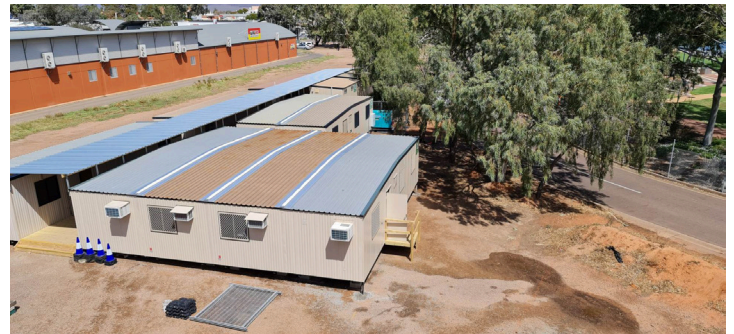
PW2PA site office under construction September 2020

One lane of traffic will remain open in both directions on the existing bridge, throughout the construction works. Speed and other traffic restrictions will be in place and signage will be prominently located to alert road users to changed conditions.