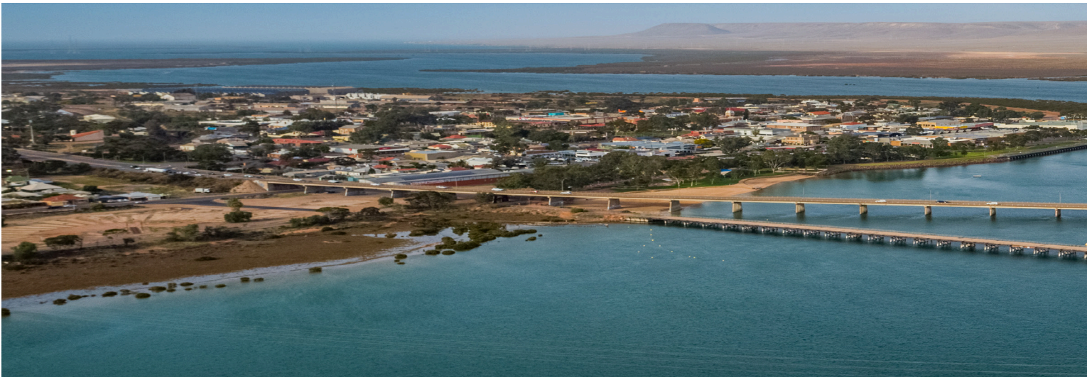
Aerial view of Joy Baluch AM Bridge September 2020