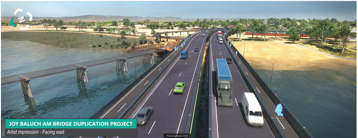
JOY BALUCH AM BRIDGE DUPLICATION PROJECT